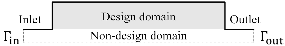
Fig. 1 – 2-dimensional muffler for acoustical topology optimization problem

Fig. 1 shows the half of a 2-dimensional concentric expansion chamber muffler which has an inlet, an expansion chamber, and an outlet. The Helmholtz equation in Equation 1 governs the acoustic pressure p inside the muffler.