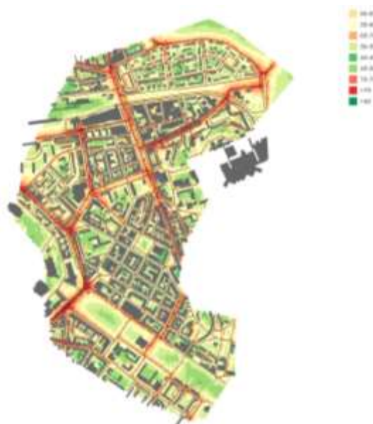
Figure 2. Noise map of the study area computed with NoiseModelling

The sensitivity analysis presented in this article is part of the CENSE project (Characterization of urban sound environments using a comprehensive approach combining open data, measurements and modeling), which includes a noise mapping case study based on both modelling and sensors deployment, in the city of Lorient, France (4). The noise map produced based on the modelling framework from the Directive 2002 serves as a support for the sensitivity analysis (see Figure 2). It covers an area of about 1 km 2 .