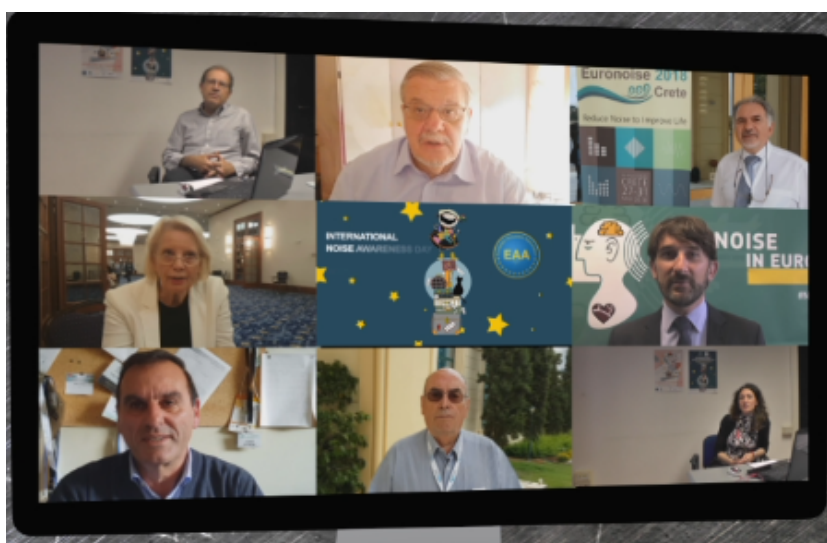
Figure 1 – Contributes by Acoustics experts for INAD film

The film reports some short interviews made to the EAA INAD IN EUROPE Steering Committee and EAA board, focusing on the importance to protect and to preserve the soundscapes of our living environment.