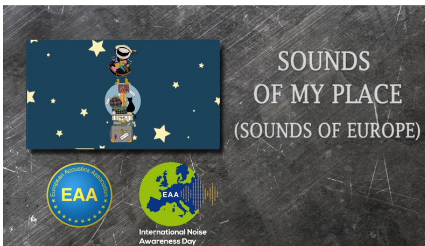
Figure 1 – Film “Sounds of my place”

In 2018 as a follow up of INAD in Europe initiative, the European Acoustics Association produced the film “Sounds of my place” [2], supported by Head Genuit Foundation, as a documentary film describing some of the INAD 2017 activities.