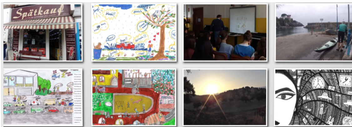
Figure 2 – Contributions by students for INAD film

The students' works show natural environments with their own sounds, like those from animals, water streams and sea waves, bird twittering, as well as anthropic sounds at schools, markets, and so forth.